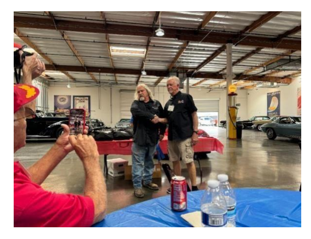
The Flight Ribbon Awards Presentation – Meet Our Fantastic Owners!