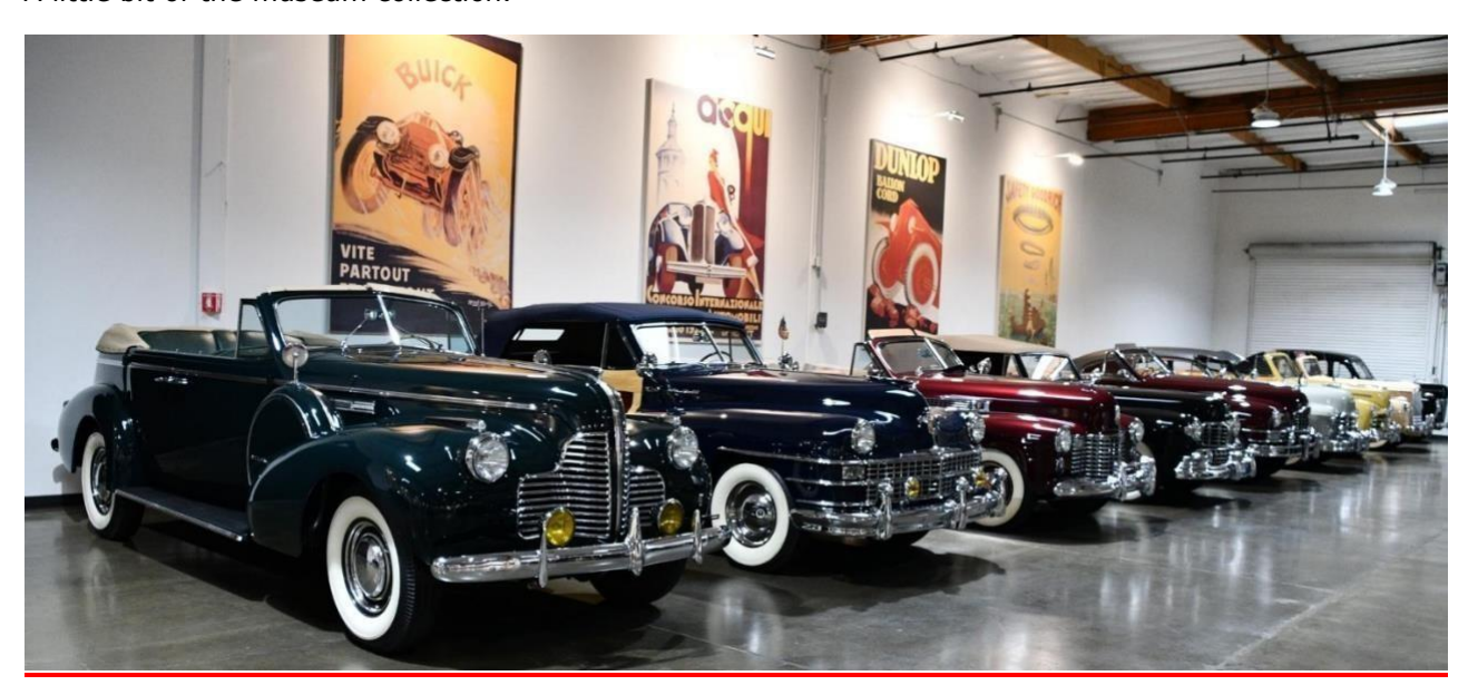
A little bit of the museum collection.