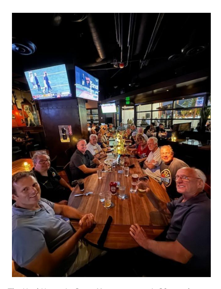
The Yard House in Costa Mesa was great! 30 members went out to dinner and our waiters were superb along with the food. Great times, great friends, and great car talk!