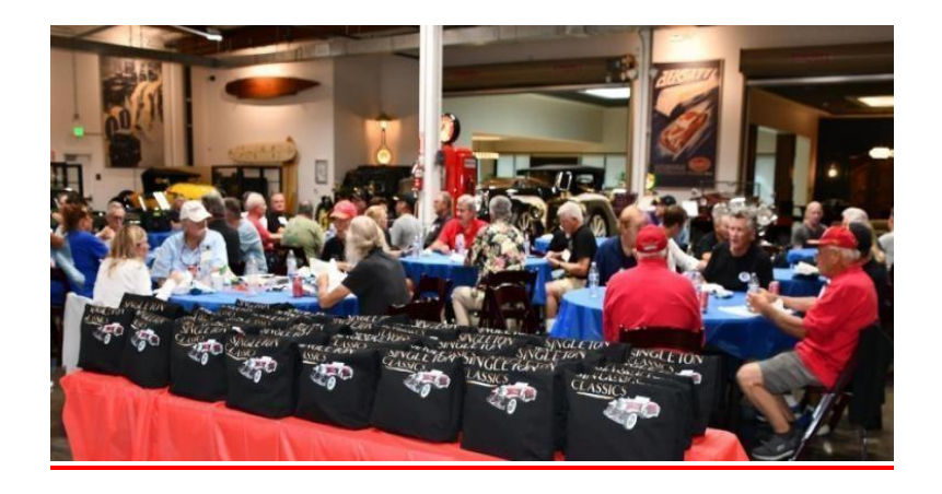
The Judge's lunch