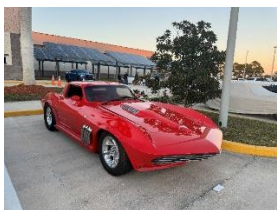
I voted Ladies Choice for this one of a kind Corvette. Open Class.

I hope you will enjoy some pictures of the Florida Regional.