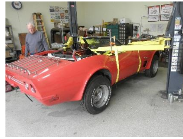
718 – body down on chassis