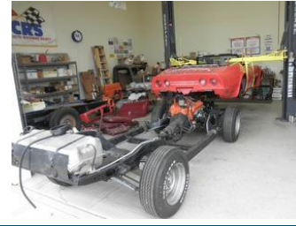
714 - Lining up chassis and body