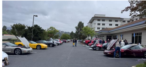
The Judging Field had three cars judged. 66 – 69 - 2003