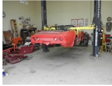
713 – Body on lift straps