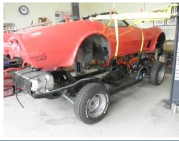
715 – body over chassis