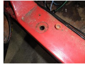
707 - L H sill w/plug removed