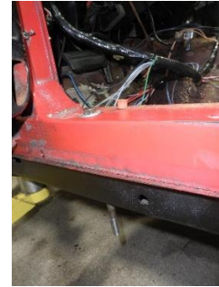
708 - LH sill w/index bolt inserted