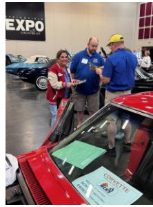
Bev LeGate C3 Exterior