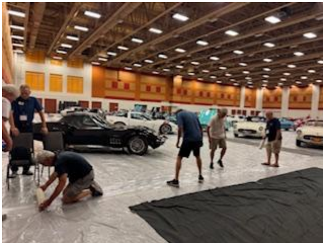
At times a conga line. They had to cover the ENTIRE ballroom floor with plastic.