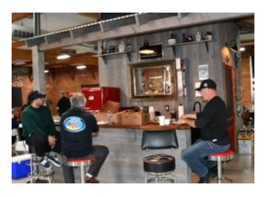
Great Lunch Location