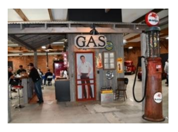
The Museum was a great place for our Meet!