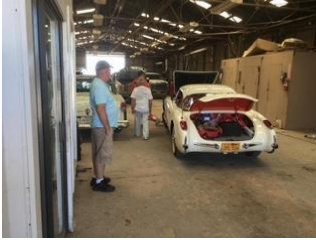
Waiting for parts.