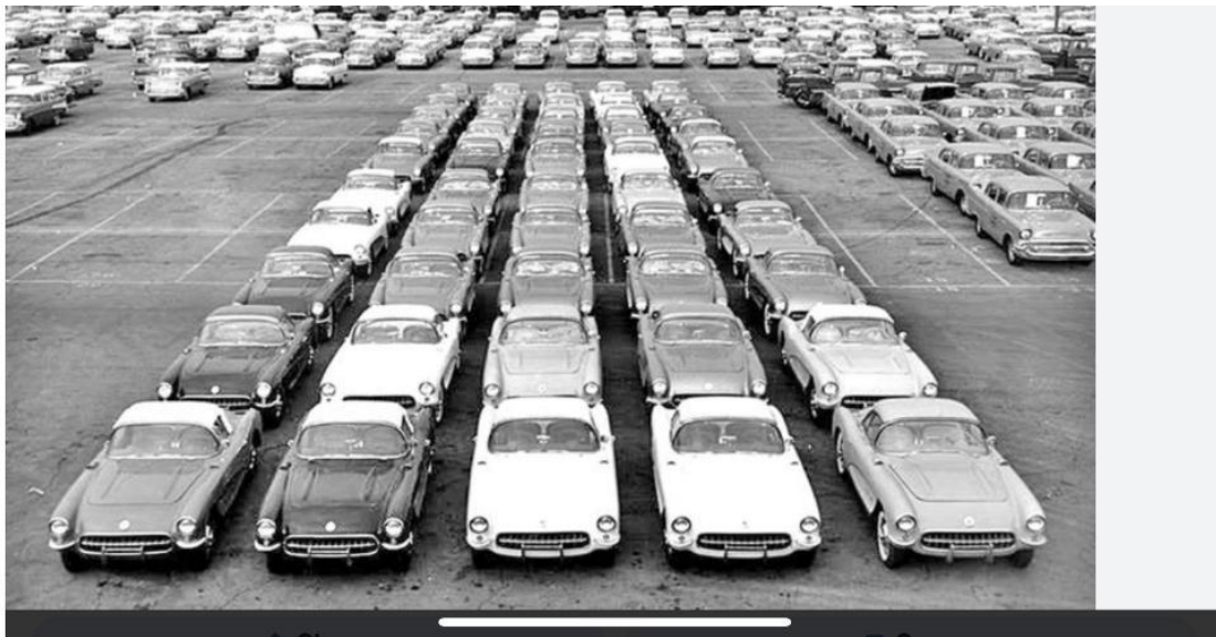
50 1957 CORVETTES AT THE ST. LOUIS CHEVROLET ASSEMBLY PLANT

*Will supply photos. All costs are plus actual shipping cost. Jerry #2466 – 951-310-6069